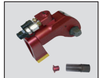
Allen hex drive adaptors (see page 76)