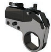
Handle kits for TWH430N