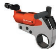
Handle kits for TWH27N, TWH54N, TWH120N & TWH210N