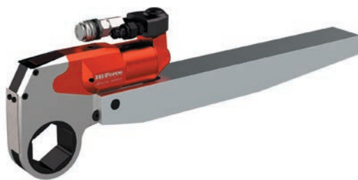
TWH-N fitted with extended reaction arm